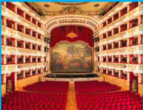
"Teatro San Carlo"