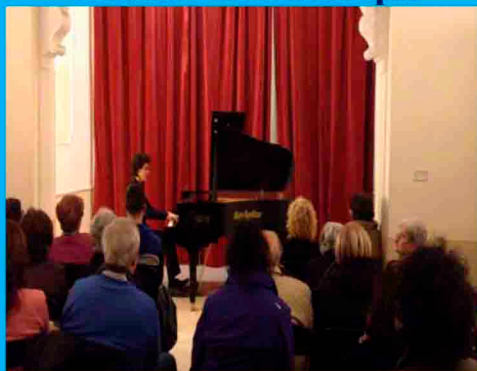
Concerto alla Sala Chopin